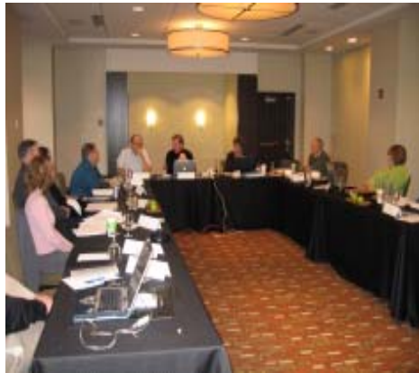
The EAGLE Commission Meeting met during National Convention 2009.

To attend National Convention you will need to make your hotel reservation and also register for the Convention using the registration form(s) located at the back of this program or by registering online at www.UMAssociation.org/nat_conv.html . The UMA's discounted rate at the Hyatt Regency Burlingame is $139.00 for a single/double room and is available for three days before/after the convention. To secure this rate, reservations must be made by midnight, January 29, 2010. Make your hotel reservations by calling 1-800-233-1234 or 1-650-347-1234. The UMA discount registration deadline is also January 29, 2010.